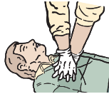
CONTINUE CPR UNTIL HELP ARRIVES OR AN AED IS AVAILABLE

If you are untrained or are unsure of your skills – don't give up. Give compression only CPR - pushing hard and fast at a rate of at least 100 times each minute.