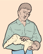
INFANT RECOVERY POSITION