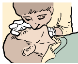
TILT HEAD BACK AND BREATHE INTO CASUALTY TWICE