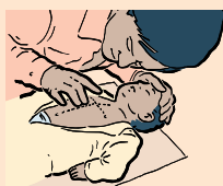
PRESS DOWN FIRMLY 30 TIMES, THEN GIVE 2 BREATHS REPEAT UNTIL HELP ARRIVES