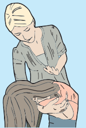
SHARP BACK BLOWS