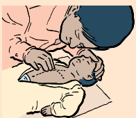
PLACE 2 FINGERTIPS ON THE INFANT'S BREASTBONE JUST BELOW THE NIPPLES