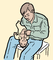
5 CHEST THRUSTS