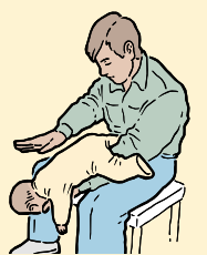
5 BACK BLOWS

If the infant becomes unconscious place him or her on a firm flat surface and send for medical help and an AED.