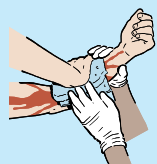
CONTROL BLEEDING IMMEDIATELY

Immediately apply direct pressure to the wound over a pad of dressings. Keep the casualty lying down.