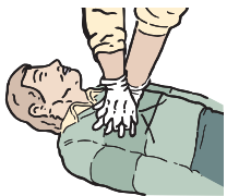
PLACE HANDS ON CENTRE OF CHEST PRESS DOWN FIRMLY 30 TIMES, PUSH HARD - PUSH FAST